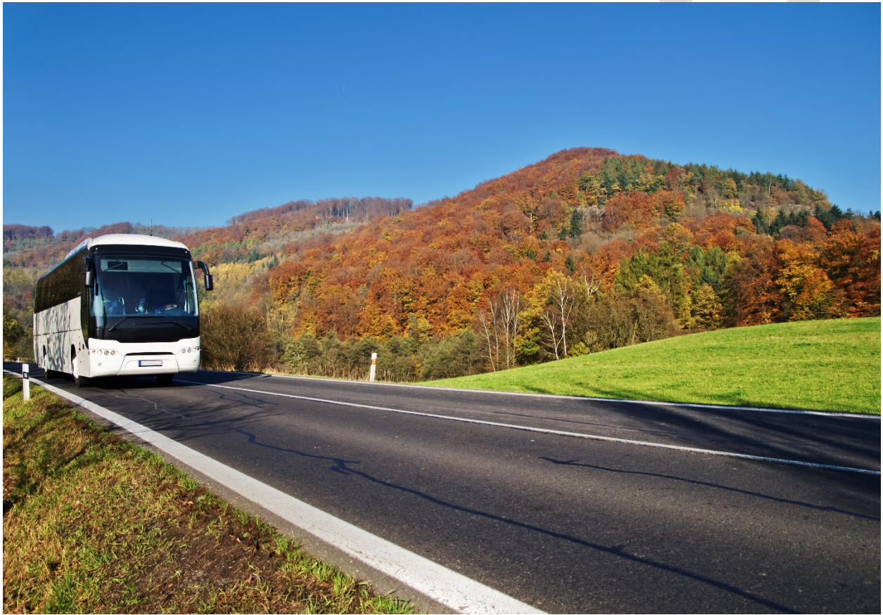
Figure 1: Fall colors of the Lakeside Pavilion stop